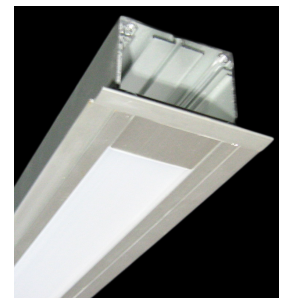
System: QS60 Recessed 90mm (W) x 60mm (H)